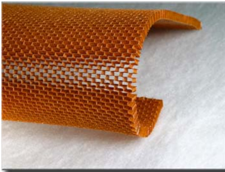
1/4" Thick Flexible Cell

In the flexible cell Nomex Honeycomb, the cell shape is rectangular, thereby allowing the core to flex in one direction easily. It is ideally suited for structures having tight radius curves. It can be rolled for shipping. The cell size is 3/16” and the density is 1.8 PCF.